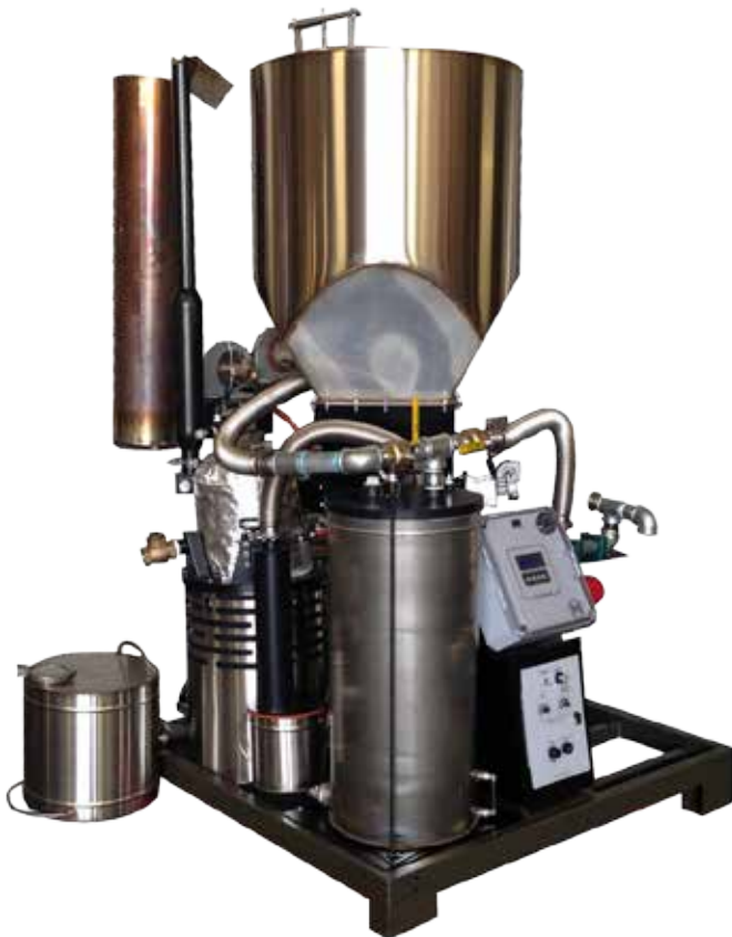
GEK Gasifier - Half Power Pallet

Complete System for Converting Biomass to Syngas