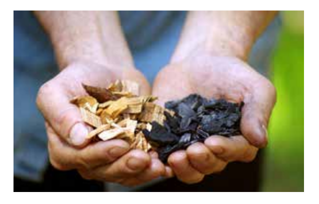
Woodchips into Biochar