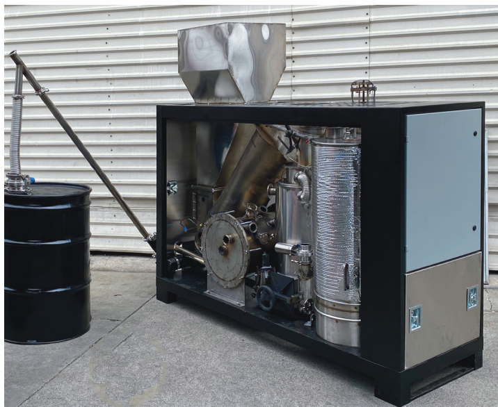
CharPallet 25 Prototype

The ALL Power Labs CharPallet 25 is a smart, compact, Combined Heat & Biochar (CHAB) gasifier system designed to convert 25 kg/hr waste woody biomass into high-quality, high-temperature biochar with optional hydronic heat and gas-making modules. It is based on our third-generation gasifier architecture using APL's novel v3.0 Swirl Hearth design, including innovations which widen the range of acceptable feedstocks, reduce feedstock preparation requirements, and greatly reduce biochar contaminants.