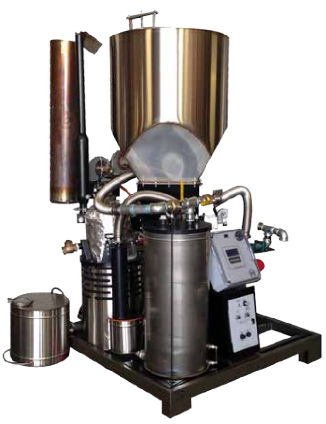
GEK Gasifer - Half Power Pallet

The GEK Gasifier makes it easy for beginners and experts alike to run high-performance solutions in small-scale gasification. Whether you are a DIY enthusiast, university researcher or OEM manufacturer, the GEK will get you over the starting hurdles of gasification, and onto the more rewarding work of making clean gas for power generation or experimental studies.