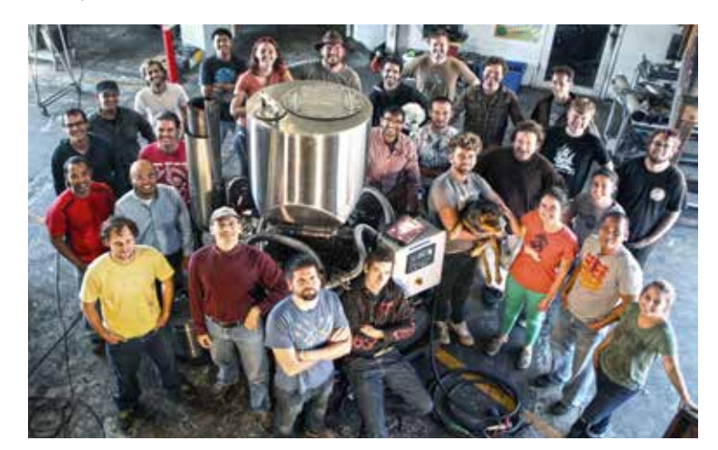
Our facility is in Berkeley, CA. Please contact us to arrange a visit next time you are in the Bay Area. We'd love to show you around.

We invite you to join us for the ongoing collaborative process of refining GEK systems, and proving gasification to be a uniquely powerful solution for individual-scale energy independence.