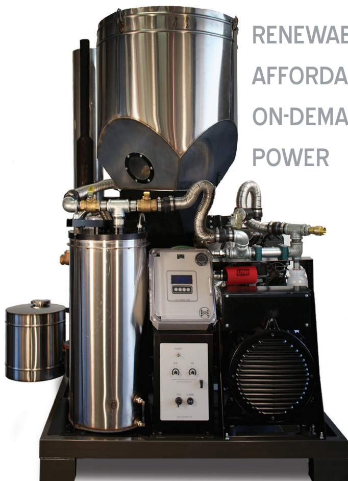
PP20 - Basic Configuration