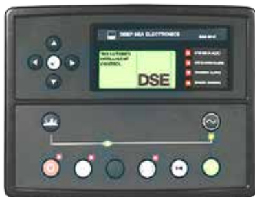
Deep Sea Grid Tie Control for Synchronous Generator