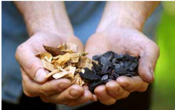
Woodchips into Biochar