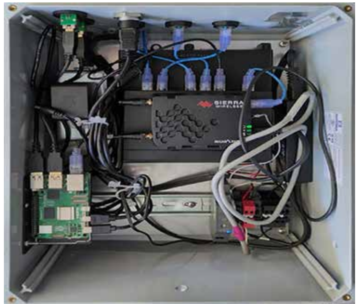
Prototype wall-mounted data collection server

The Gasification Test System includes a monitoring package leveraging current protocols making the system into a Smart Device allowing the capture and management of operational data. It collects and transmits over 250 operations data-points directly from the equipment in real time. This critical information is securely stored in an on-site server as well as on a remote APL server to enable remote APL support and monitoring. The Base Monitoring System is designed to be a robust, high-availability platform, with provisions for an International Cell Modem/Plan.