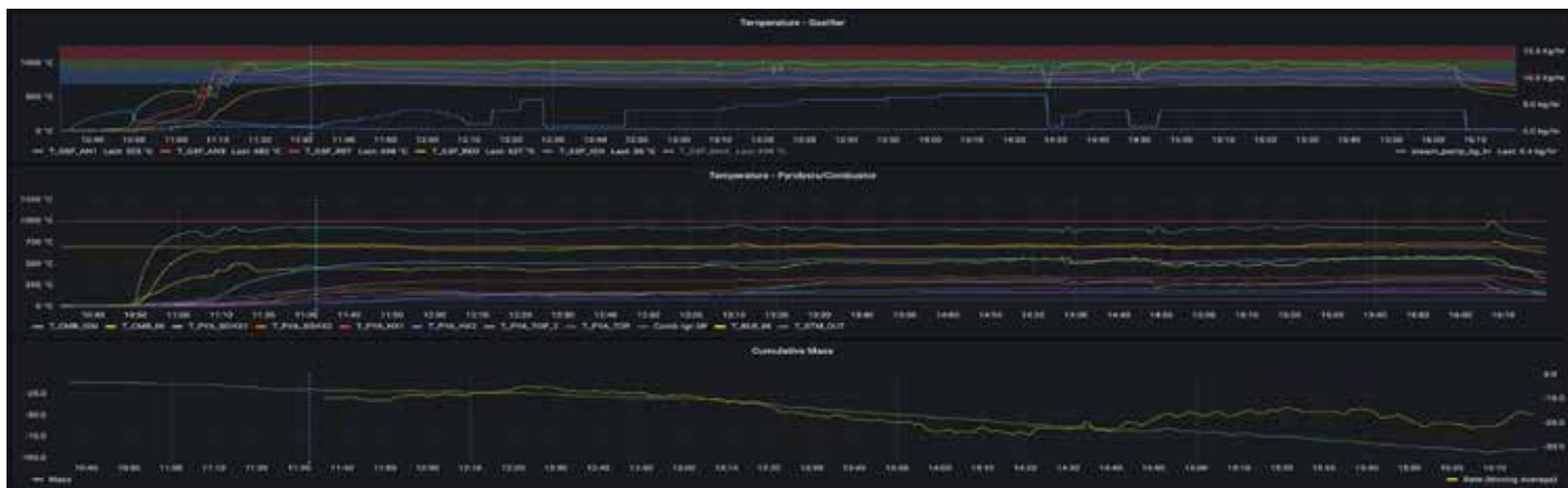
Example Monitoring Chart

Additional hardware and support modules described below are integrated into the API to enhance data collection with gas sampling and analysis hardware and software to streamline the establishment of a comprehensive research and development system.