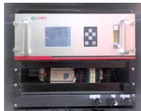
Prototype Gasboard Analyzer